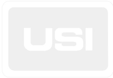
SWIFT LIFT HOOK SYSTEM